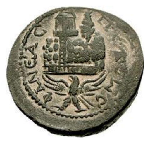
Samaria, Neapolis, Bronze AE27, A K G T GALLON - Bust right FL NEAC POLEwC - Mt. Gerizim with Samarian temple complex, all supported by eagle (251-253 AD) <a href="http://www.tantaluscoins.com/coins/16952.php">http://www.tantaluscoins.com/coins/16952.php</a>