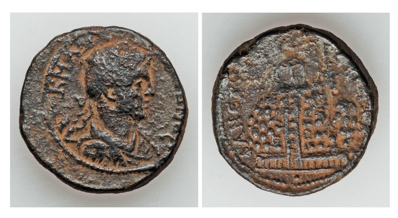
Neapolis, Samaria. Elagabalus (AD 218-222). Æ 28mm (15.48 gm). Laureate, draped, and cuirassed bust of Elagabalus right / Mount Gerizim with gardens and shrines, Temple on top. Rosenberger 38 var. (no star or crescent in fields. Green patina with red earthen highlights. Very Fine.Ex Shoshana Collection