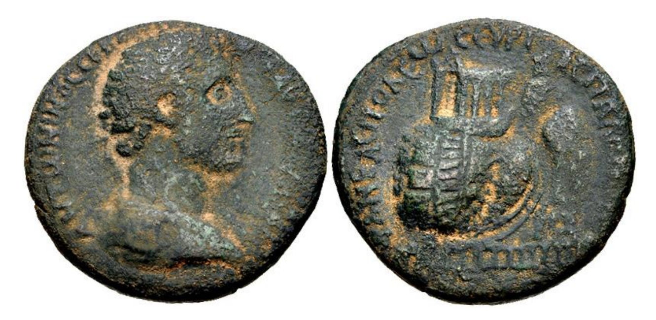
JUDAEA, Neapolis. Antoninus Pius. AD 138-161. Æ (32mm, 20.13 g, 12h). Laureate, draped, and cuirassed bust right / Mt. Gerizim with stairway leading to temple and altar at summit; colonnaded portico at foot of mountain, [date] in exergue.