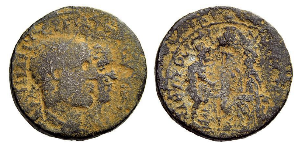
Bronze, Neapolis. 247–9 AD. Æ 14.36 g. Traces of inscription IIMM CC P FILIPPIS AVGG – Jugate busts of Philip I and Philip II r., both draped and laureate. Rev. Traces of inscription NEOPOL NEOCORO; in exergue: [COL] – on I., nude male figure standing r., wearing helmet, resting I. foot on rock (?) extending hand at female figure seated on r., extending her r. at him; above hand three pellets; between the two figures, spear or labarum topped by Mount Gerizim.

JUDAEA, Neapolis. Philip I. AD 244-249. Æ (28mm, 13.15 g, 6h). Laureate, draped, and cuirassed bust right / Helmeted figure (Athena?) seated facing, resting right foot on uncertain object, holding spear or scepter; to left, two male figures standing facing one another, that on the right raising hand and holding scepter; to right, female figure standing left, raising hand and holding scepter; Mt. Gerizim surmounted by temple complex above figures on left, star in exergue. Harl 21 (A5/P19) corr. (illustrations for 21 and 26 switched); Rosenberger 82 = Sofaer 158 (same dies); cf. SNG ANS 1017 (same type but figures arranged slightly differently; same obv. die); BMC 123 (same dies). Good VF, earthen green patina. Very rare and attractive for issue. See link