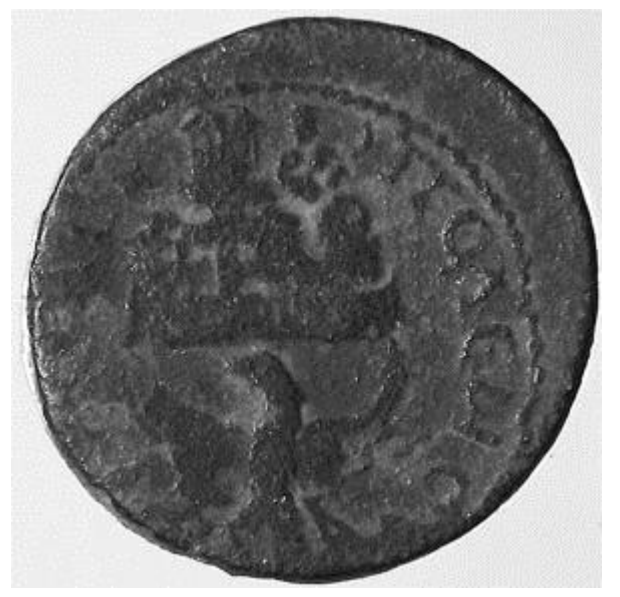
Left: Neapolis, Trebonianus Gallus. 251-25 AD3. Æ 25.5mm (14.54g). Laureate bust right/Mt. Gerizim, supported by eagle, with spread wings and head left