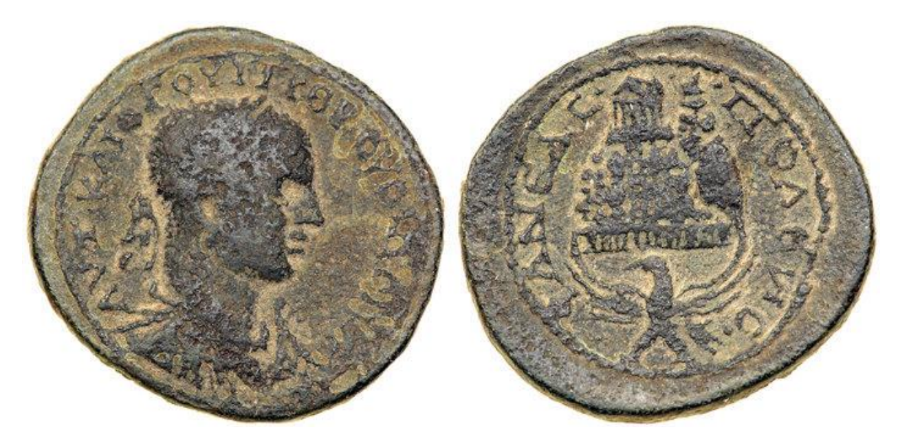
City Coins, Neapolis. Volusian, 251-253 AD. AE 27 mm. . Hen-882. Laureate and draped bust right. Reverse: Eagle supporting Mt. Gerizim, with temple.