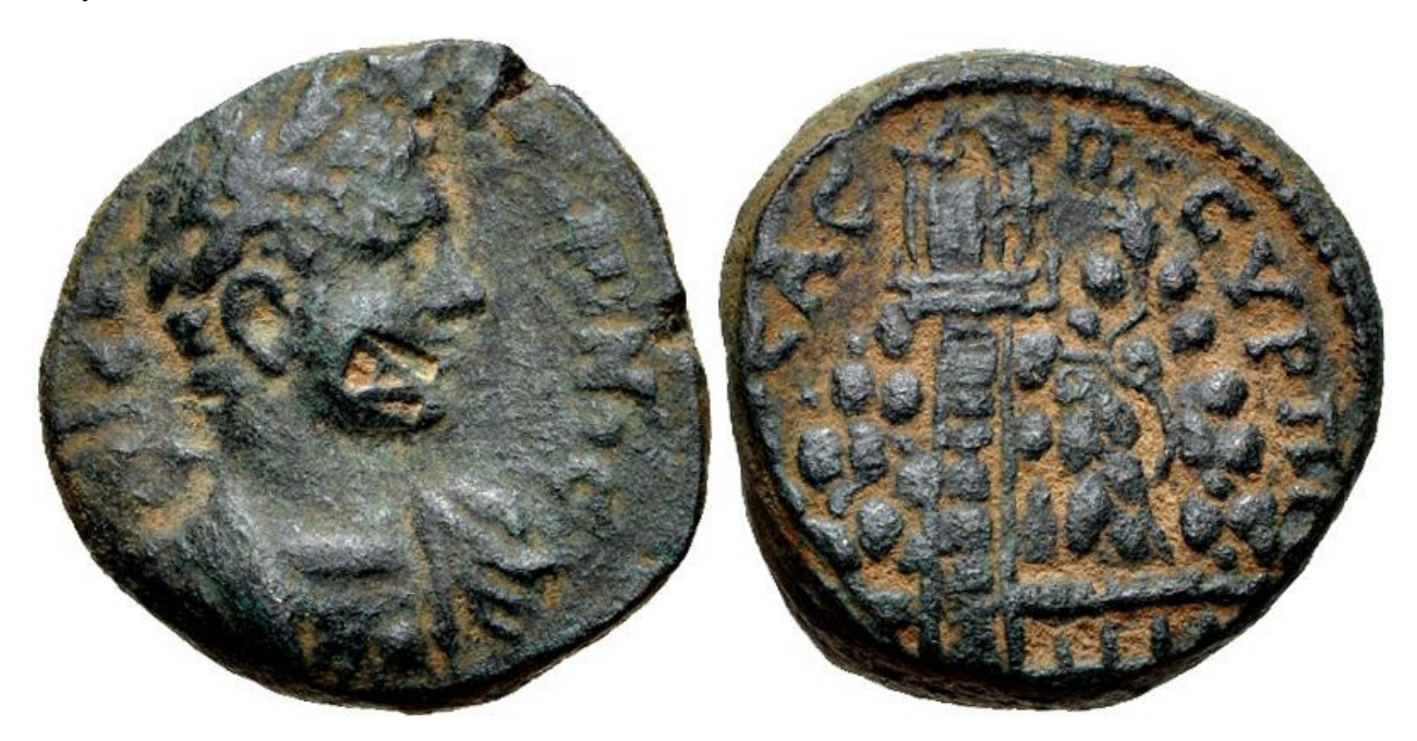
JUDAEA, Neapolis. Elagabalus. AD 218-222. Æ (19mm, 9.07 g, 1h). Laureate, draped, and cuirassed bust right; c/m: large A within incuse rectangle / Mt. Gerizim with stairway leading to temple and altar at summit; colonnaded portico at foot of mountain.