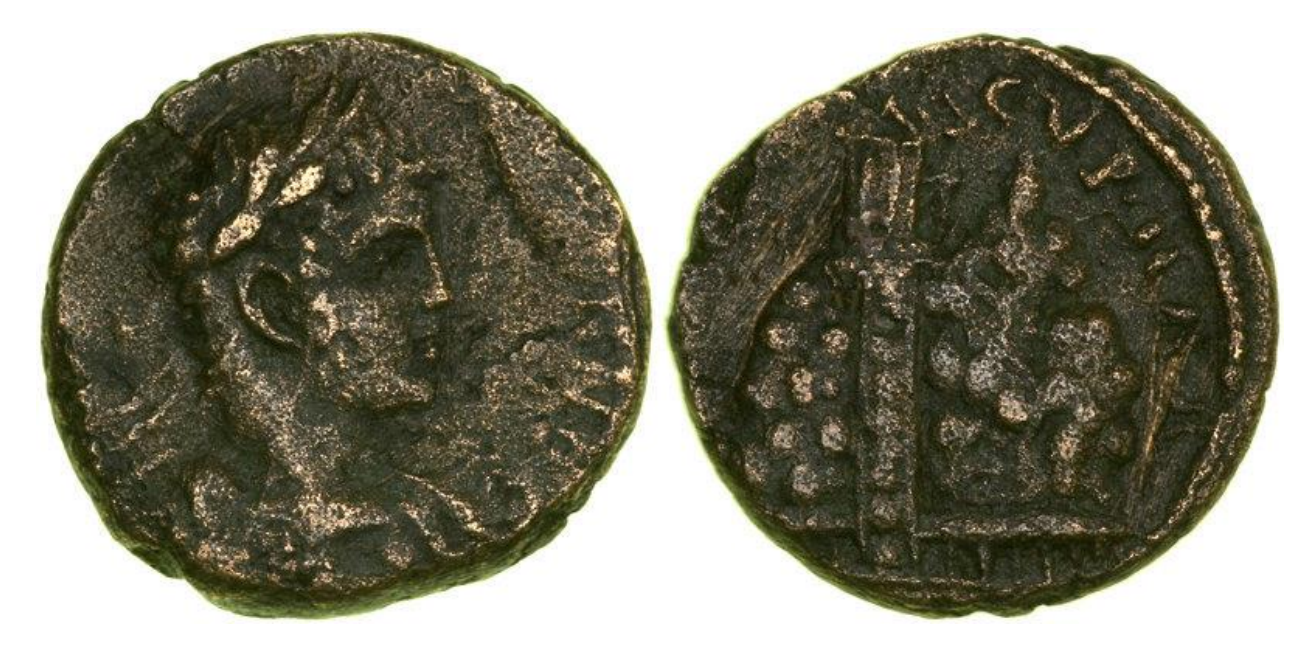
City Coins. Neapolis. Elagabalus, 218-222 AD. AE 21 mm. . Hen-1960. Laureate, draped, and cuirassed bust of Elagabalus right. Reverse: View of Mt. Gerizim, with colonnade, steps, shrines, etc.