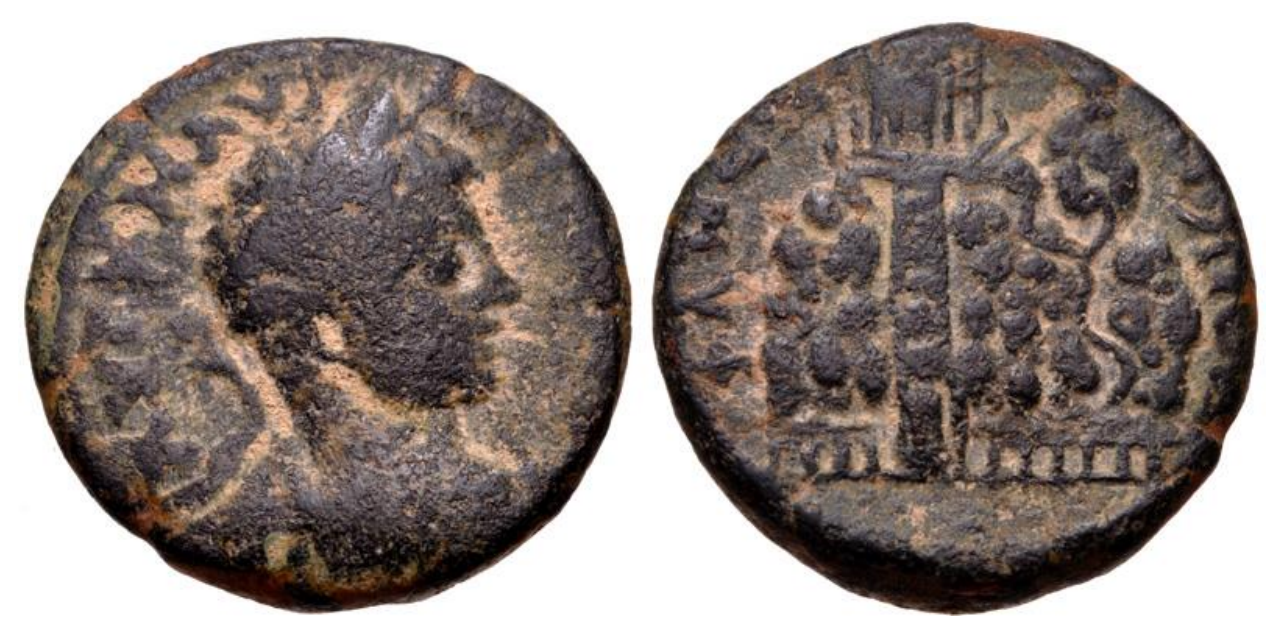
JUDAEA, Neapolis. Elagabalus . AD 218-222. Æ (21mm, 7.47 g, 12h). Laureate, draped, and cuirassed bust right / Mt. Gerizim with stairway leading to temple and altar at summit; colonnaded portico at foot of mountain. <u>Link</u>