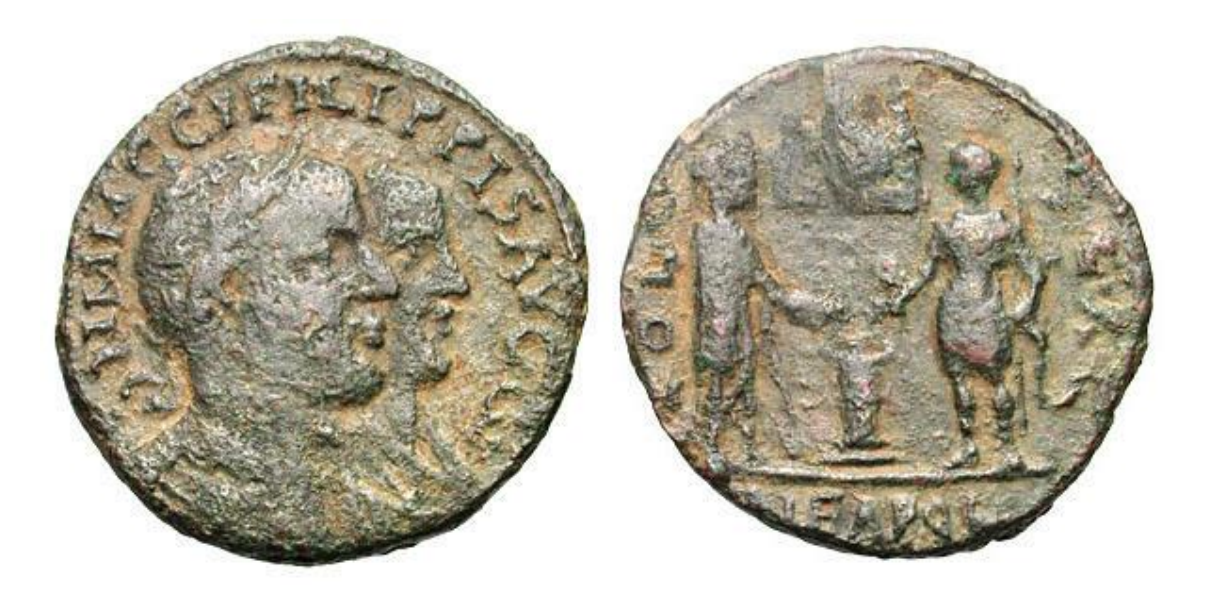
Philip I and Philip II. 244-249 AD. AE 27, 13.35g. Samaria, Neapolis, 247-9 AD. Obv: IIMM CC PFILIPPIS AVGG Jugate busts of the two emperors right, laureate, draped, cuirassed. Rx: COL - SERG around, NEAPOL in exergue, the two emperors standing facing one another, holding spears and sacrificing from pateras over altar between them; Philip I, on the left, is togate, Philip II, on the right, wears military dress; above in field, Mount Gerizim with twin peaks surmounted by temple and altar. An interesting reverse type suggesting that the emperors actually visited Neapolis late in their reign; not previously known with the jugate portrait on obverse, which was struck from only this single obverse die.