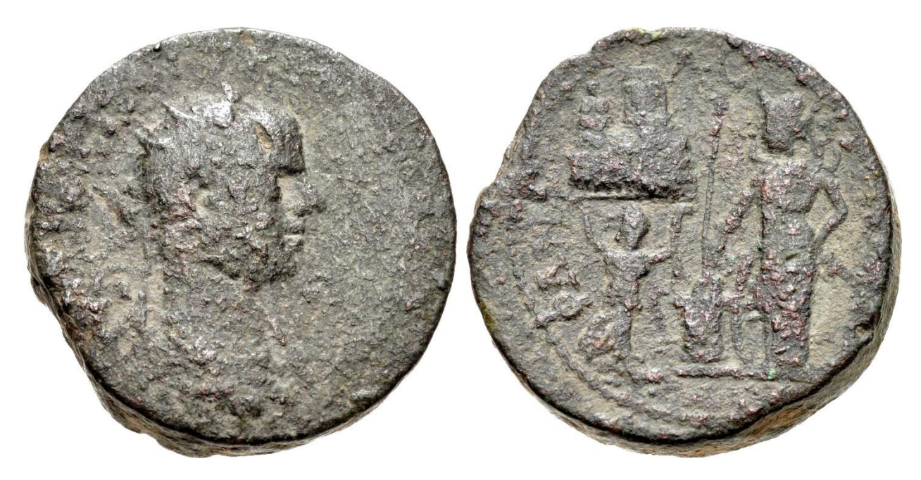
JUDAEA, Neapolis. Volusian. AD 251-253. Æ (24mm, 15.30 g, 6h). Radiate, draped, and cuirassed bust right / Athena standing left, with shield and spear at side, sacrificing over altar; to left, female figure advancing right, supporting Mt. Gerizim surmounted by temple complex. Link