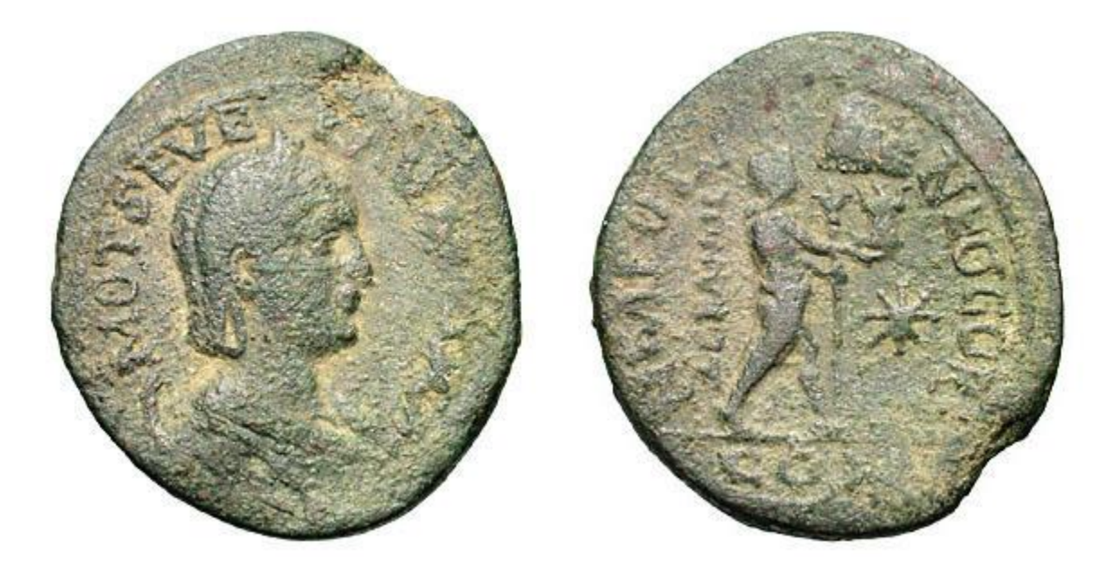
Otacilia Severa, Wife of Philip I. . AE 27-29, 15.45g. Samaria, Neapolis, 247-9 AD. Obv: M OT SEVE -RAE AVG M C Draped bust right on crescent, wearing stephane. Rx: NEAPOLI - NEOKOP around, COL in exergue, ΔΕΚΑΝΟC written upwards in left field, male figure (Decanus) stepping right, polos on head, holding in right hand small altar from which lily and two palm brances project and in left hand scepter topped by lily, in lower right field star, above Mount Gerizim with colonnade at base and twin peaks surmounted by temple and altar.