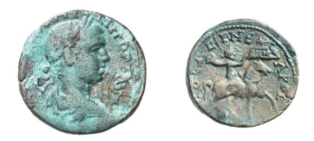
Philippus II., 246-249.. Bronze, Neapolis in Samaria. Büste / Kaiser zu Pferd vor Berg Gerizim.