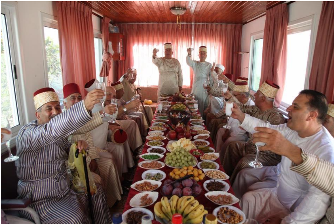
'On the occasion of the first month of the Hebrew year blessed to take