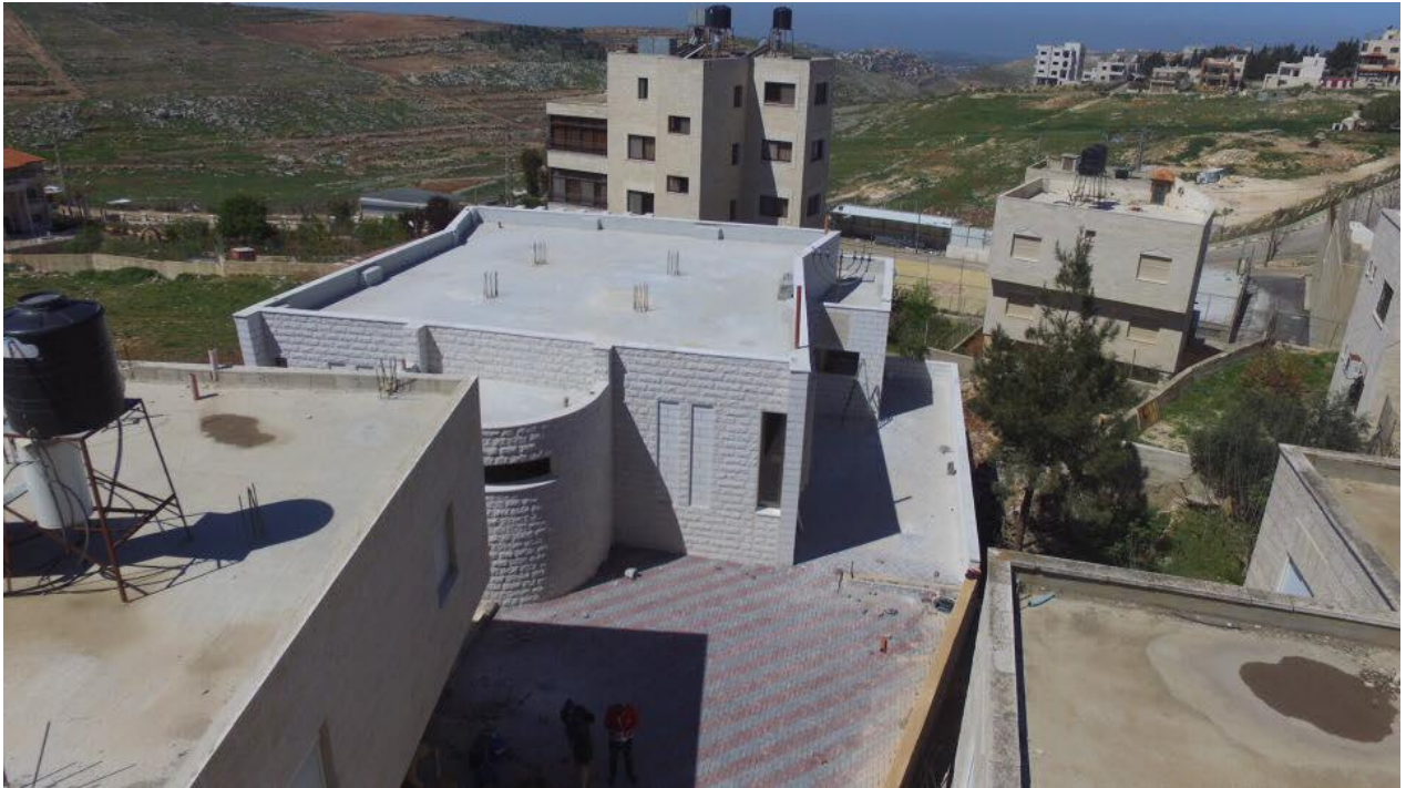
~~~~~ Scroll photo by Amit Marhiv , March 3, 2017 at the Samaritan Synagogue on Mount Gerizim (Facebook Post)