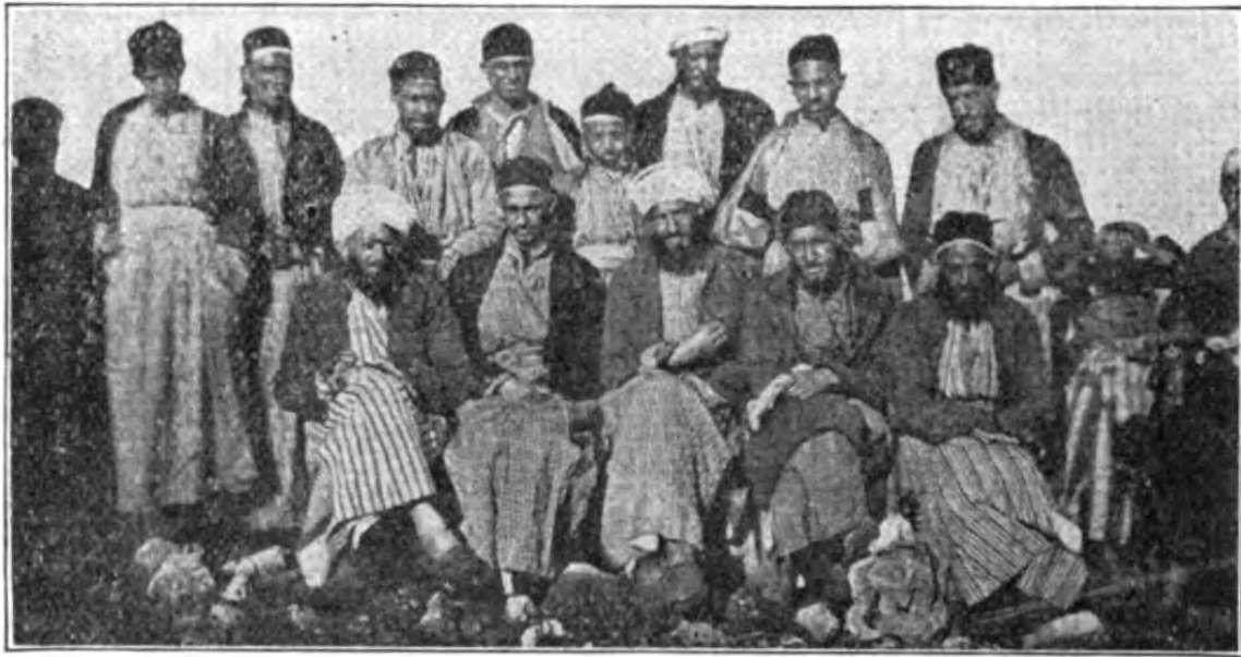
GROUP OF SAMARITANS. (from page 275)

As to the numerical strength of the sect at the time of its origin there are no reliable sources of information available. At no time during its history does it seem to have gained material strength of numbers and it has always remained confined to the narrow limits of Samaria. Some idea of the greatest strength of the sect can be gained from historical sources. According to Jos. Flavins (Bell. Jud. III. 7. 32) when the Samaritans tried to oppose the advance of Vespasian on Mount Garizim in the year 67 (A. D.) (p. 276) there were 11,600 of them slain in battle. They seem to have recovered from this serious defeat, as it is known they were granted special favors by the Romans on account of the valuable assistance they had given to the Roman forces in their campaigns against the Jews during the period of Bar-Kochbas. Their intense hatred towards the arising and not yet firmly established Christian Church was particularly pronounced and can probably be traced to their deeply rooted monotheistic belief, that repeatedly led them